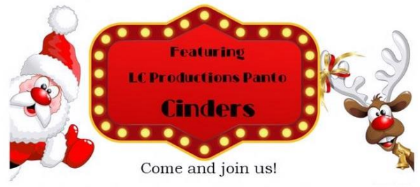
Featuring lots of lovely stalls and gift ideas, as well as hot and cold drinks, raffle, tombola, refreshments, face painting, Preplings Choir and Santa's Grotto.

Liverpool College MV Hall (entrance via Prep car park), Queens Drive, Mossley Hill, L18 8BG