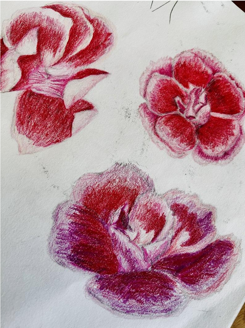
Floral coloured pencil sketchbook study.

Our artist of the week is Zefali M (Ch11):