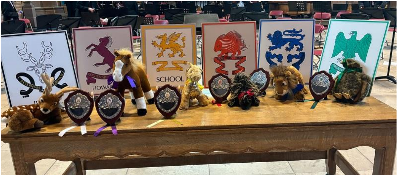
Pre Prep, Prep and Secondary house emblems on display in the Cathedral during our Founders' Day Service

The Boarders started their Founders' Day celebrations early last Thursday evening with a formal Boarders Founders' Day evening meal. The very tasty menu of roast beef and Yorkshire pudding was very welcome at the end of a long school day and it was lovely to see the boarders celebrating with their guests at the event.